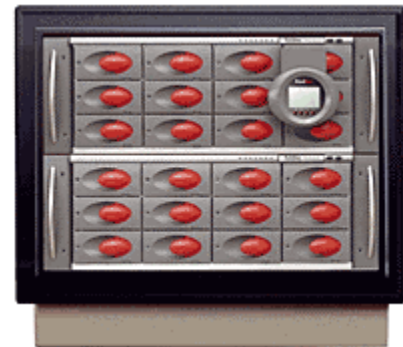
Two-unit FlexArrayHI12 Rack Configuration