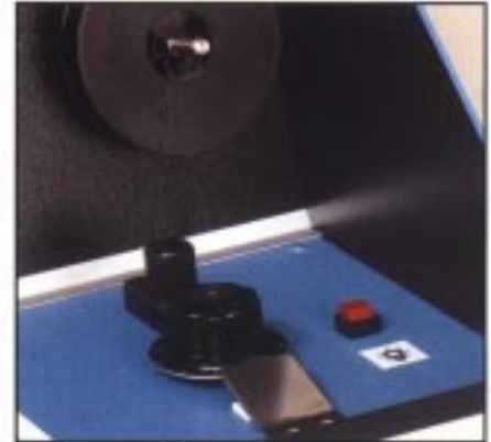
Exposure Settings ▲

The film drive is designed so as to eliminate any drive roller contact with the film emulsion surfaces, thereby reducing the risk of scratching and damaging the films. Precise film tracking is ensured through use of individual 16mm and 35mm exposure rollers, which have the added benefit of ensuring proper resolution.