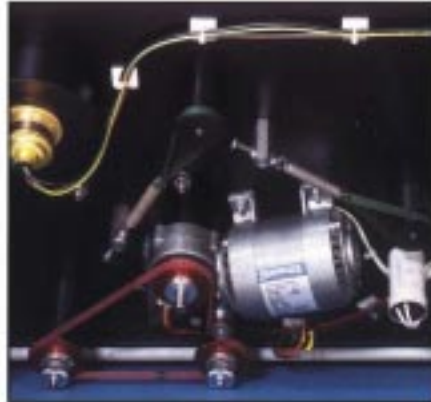
Improved Transport Mechanism ▲